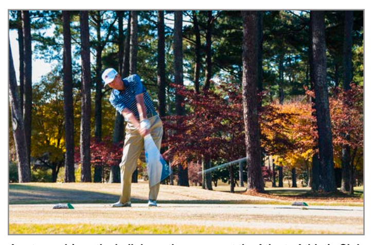
A veteran drives the ball down the course at the Atlanta Athletic Club in John's Creek, Ga., Nov. 10, 2014. The AAC hosted a Veteran's Golf Tournament for club members and current servicemembers on their Riverside course, ranked as one of the top private courses by Golf Digest.

Firefighters from the 94th Civil Engineer Squadron enter a burning building to put out a fire during a controlled burn fire exercise at Dobbins Air Reserve Base, Ga. Nov. 5, 2014. Controlled burns help fire departments receive realistic hands-on experience.