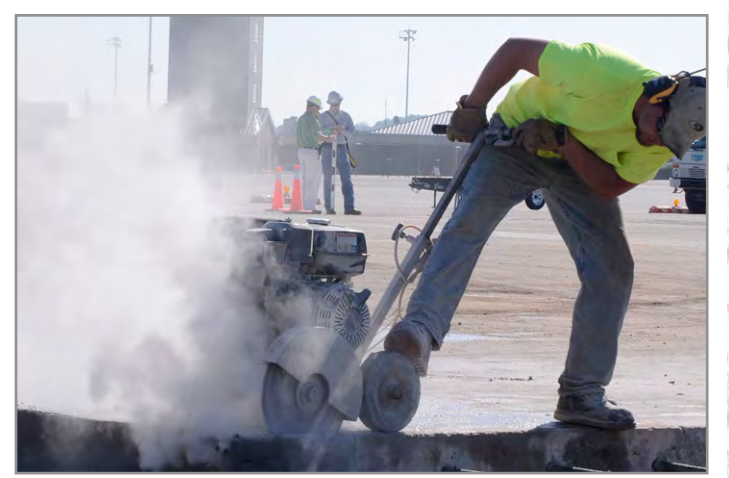
Contractors perform repairs to the Dobbins flightline taxiway A March 10.