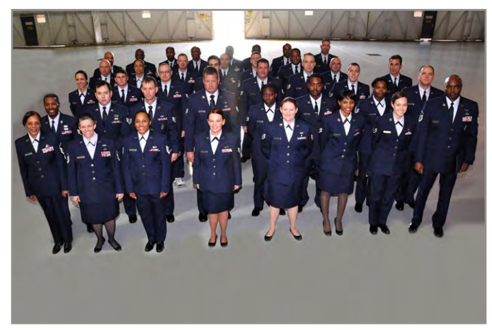
Recently promoted Staff and Master Sgts. were recognized during a NCO and SNCO Induction Ceremony here, March 2. The event was hosted by the Dobbins 56 Group and Top Three Organization.